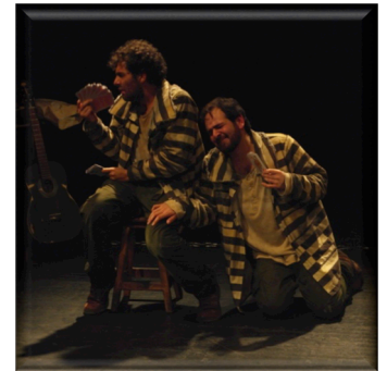
El príncipe ynocente. Efe Tres Teatro.