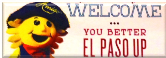
City mascot Amigo Man welcomes you to El Paso.

Call for Papers: The AHCT Annual Spanish Golden Age Theater Symposium, March 31-April 2, 2016, Hilton Garden Inn, El Paso. Submission deadline: September 1, 2015.