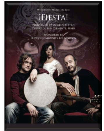
Morfeo Teatro's "¡Fiesta!"

Modern Language Association Convention 2016, Austin, TX. The MLA Forum on Sixteenth- and Seventeenth- Century Spanish and Iberian Drama has organized three sessions for next year's convention: "Comedic Desires," with papers by