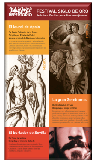
Poster courtesy of Allison Astor-Vargas and Repertorio Español.