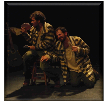
El príncipe ynocente, Efe Tres Teatro.