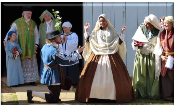
"A Historic Indian/Spanish Wedding."

Theater with a Mission presents "A Historic Indian/Spanish Wedding." Spanish La Florida: the war-torn year of 1703. Spanish missions are under attack by English-speaking Europeans to the north and non-Christian Natives to the west. So the Spanish soldiers and the Christian Indians who live at Mission San Luis are fighting back – by getting married! Theater with a Mission cordially invites you to a Historic Indian/Spanish Wedding on Sunday, February 12, 2017, 2 p.m., at Mission San Luis, 2100 West Tennessee St., Tallahassee, FL. This dramatic reconstruction of real life in Spanish Florida lets you join in the wedding procession, participate in the ceremony, and dance at the newlyweds' fiesta , featuring songs from the 1600s, a toast from the Quijote , and a performance of Cervantes's El retablo de las maravillas . Visit the facebook page https://www.facebook.com/TheaterWithAMission/ for complete details, and view a preview of this historical re-enactment at: https://www.youtube.com/watch?v=IFnaM3WWxAK&feature=youtu.be .