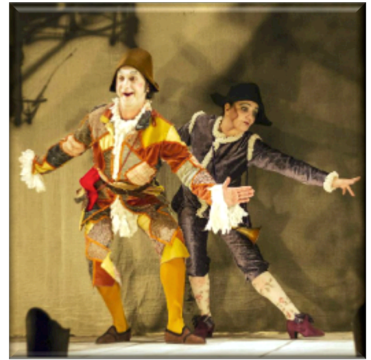
El retablo de la maravillas, Morfeo Teatro.