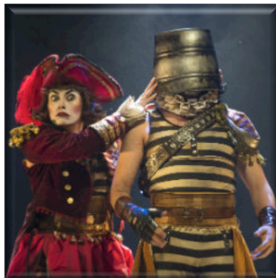
¿Qué con Quique Quinto? Cabaret Misterio & Efe Tres Teatro.

The 42 nd annual Siglo de Oro Festival at the Chamizal will take place Wednesday, April 19, through Saturday, April 22, 2017, with all shows beginning at 7:00 p.m. The Festival will feature: