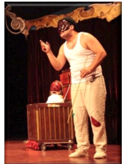
La reunion de los Zanni . Photo courtesy of the Chamizal National Memorial.

El retablo de las maravillas , Saturday, April 22, by Miguel de Cervantes, performed by Morfeo Teatro, Spain, directed by