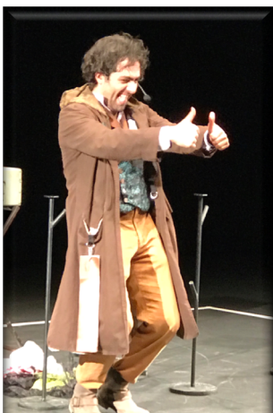
El Merólico , by Efe Tres Teatro.