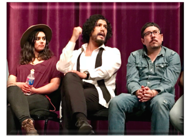
The cast of Fuenteovejuna, by Telón de Arena, speak to the audience.